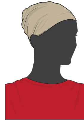
Head gear/ bandana